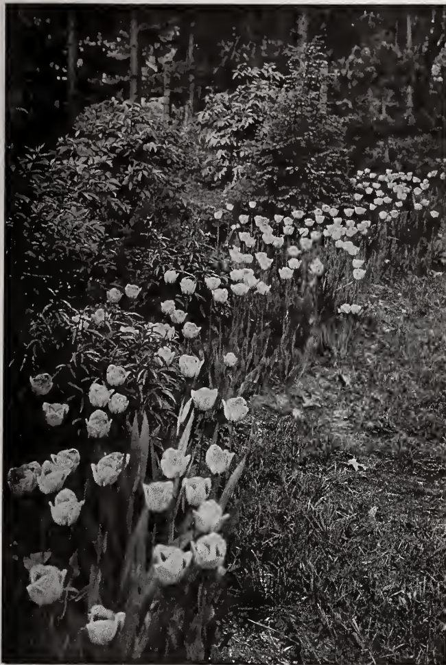
Darwin Tulip, Rev. Ewbank, planted along the shrubbery border

Mme. Barrois. Dull lilac-rose, with soft rose margin which changes with age to pale flesh-white; bluish base. A fine new Darwin of very attractive tone. Height 25 inches.....$2 00 $15 00 Madame Krelage. Bright rosy lilac, with a pale silvery margin. A good forcing variety and excellent for the border as well. Height 28 in... I 00 7 00 $68 00 Madame Raven. Dark cherry-rose, edged rosy white; white base, blue halo; medium-size flower of perfect shape. A variety of the same general character as Edmee or Mme. Krelage, but with sharper contrast between the dark rose and almost clear white edge. Height 25 in. I 20 9 00 88 00 Marconi. Deep purple when the flower first opens, gradually changing to ashy purple as the flower ages; pure white base. Height 27 inches . . . . . 85 6 00 58 00 Margaret. Pale rose ground, faintly flushed white, center white, marked blue—a very delicate color; flower globular in shape, borne on a strong stem. Splendid for forcing. Height 22 inches.... 60 4 00 38 00 Massachusetts. A long and beautiful flower; clear carmine-rose at the midrib, toning off to soft pink at the edges, the inside of the white base delicately tinged blue. Height 26 inches. . . . . 85 6 00 58 00 Massenet. An exquisite shade of pale rose, with a broad margin of creamy white; base bright blue. A grand acquisition to any collection however rare. Height 30 inches..... I 25 10 00